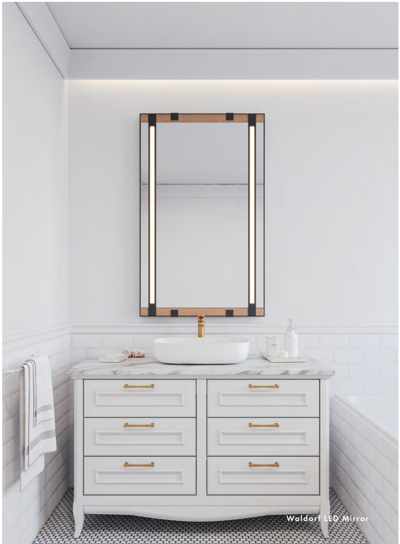
Waldorf LED Mirror