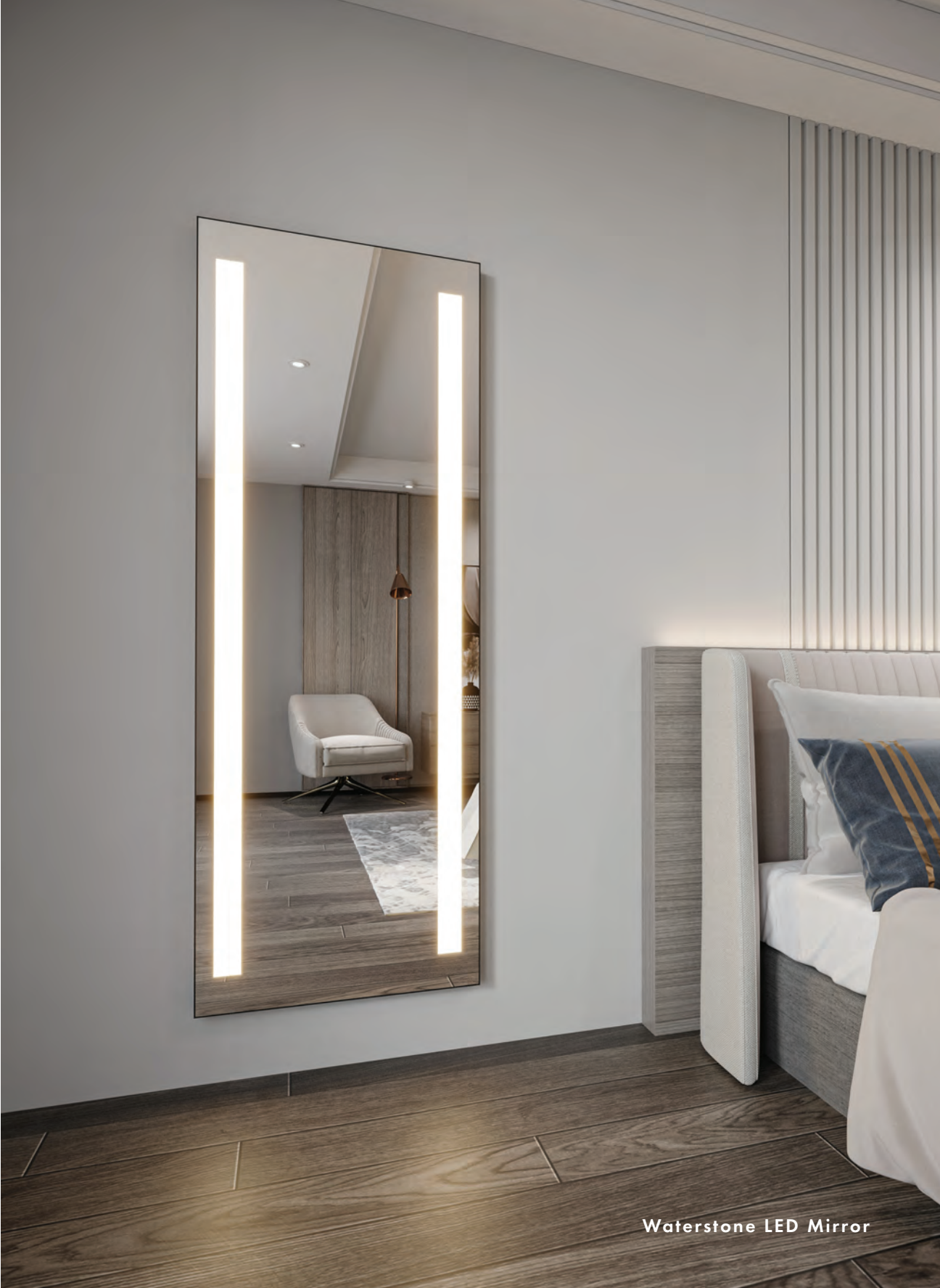
Waterstone LED Mirror