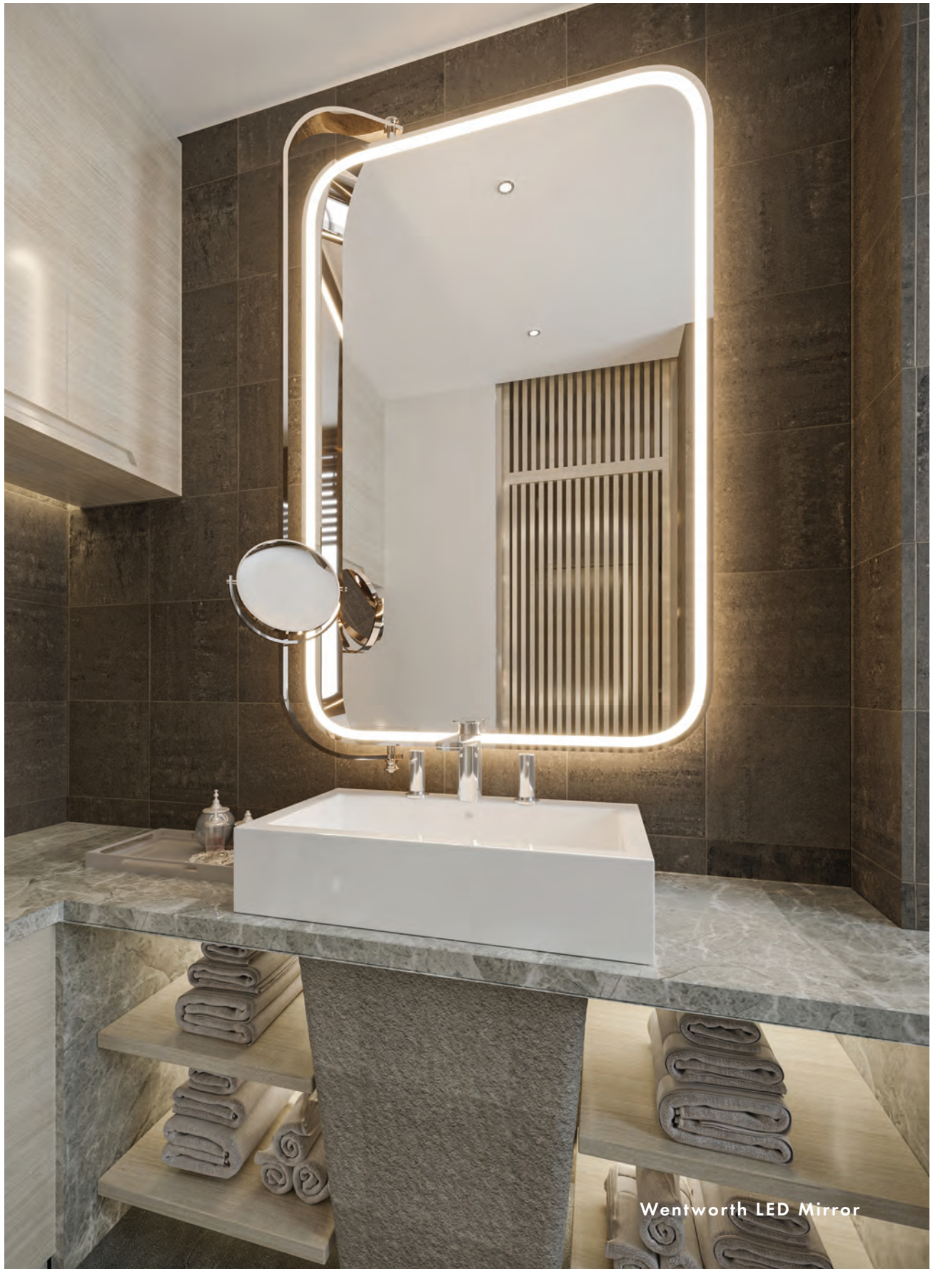
Wentworth LED Mirror