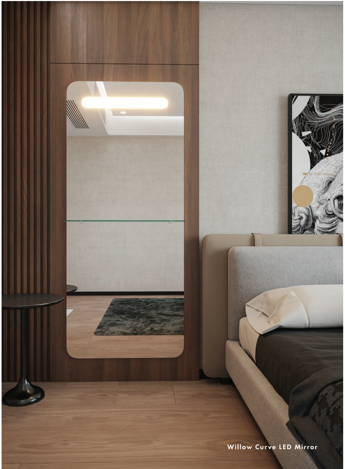
Willow Curve LED Mirror