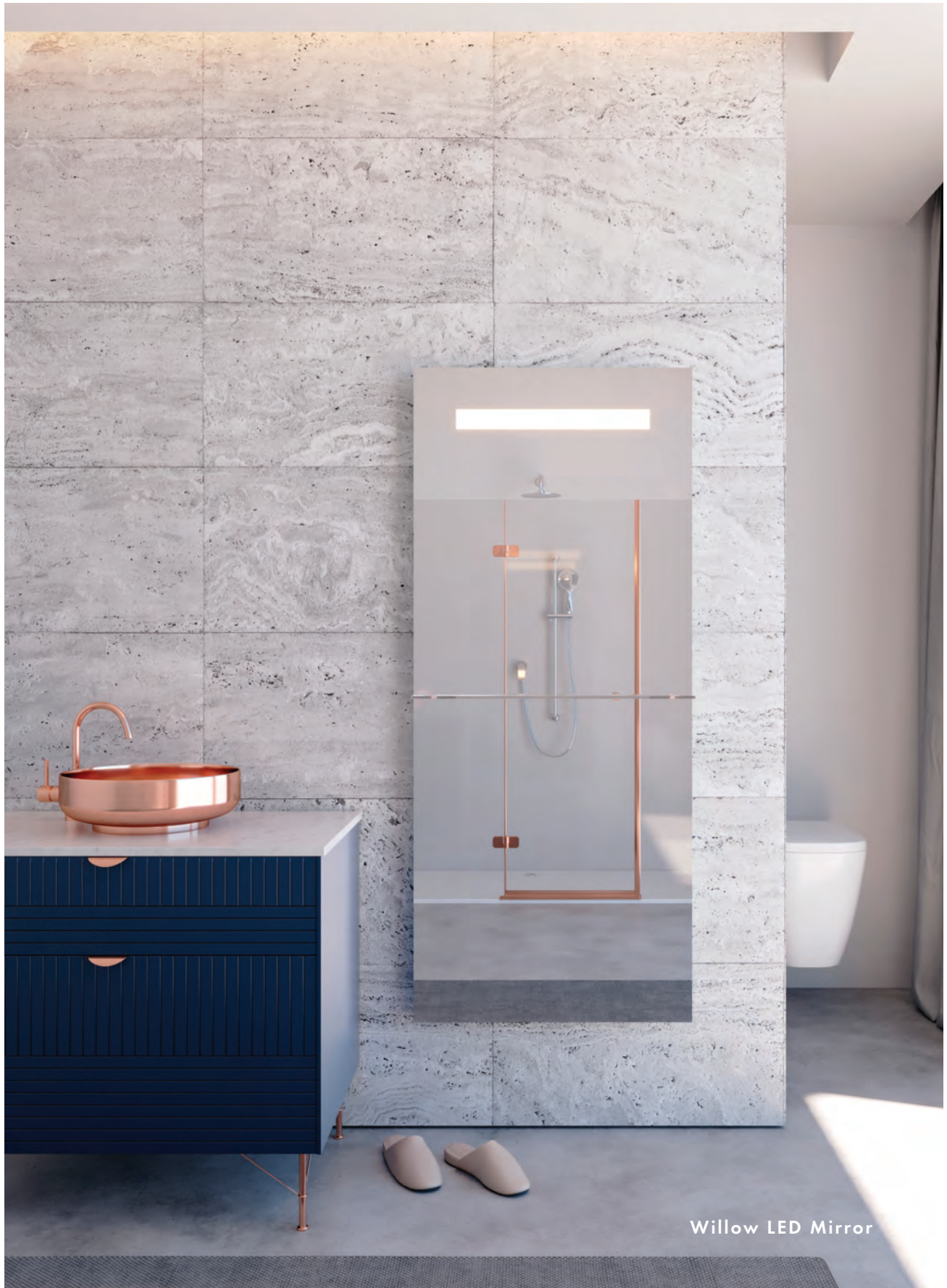
Willow LED Mirror