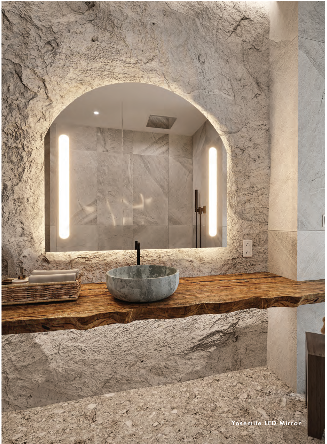
Yosemite LED Mirror